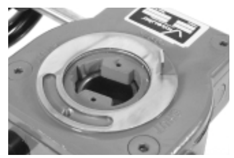
1. Install the memory stop onto the gear operator, making sure the tapped hole is centered in the slot of the memory stop, as shown above.